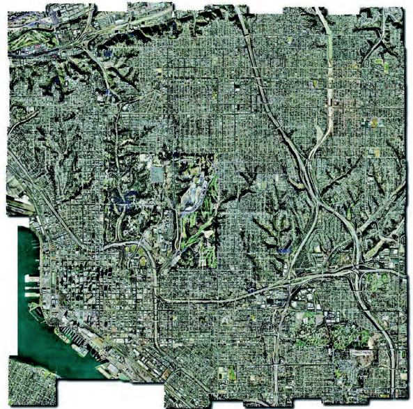
After mosaicking and compression: 1 Image and only 500MB of data