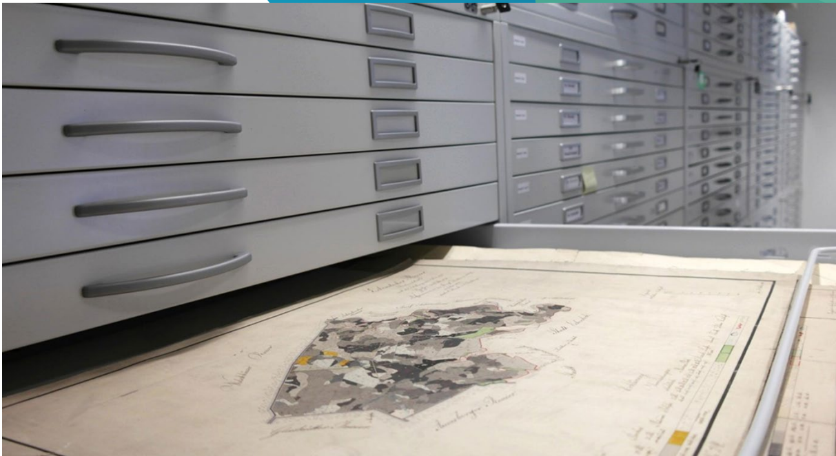
Archive with thousands of printed maps

The digitalization of data management and the use of modern remote sensing technologies have revolutionized the foundation for the sustainable management of Saxony's forests. Sachsenforst, represented by the Centre of Competence for Forests and Forestry, also relies on solutions from GEOSYSTEMS Germany that are built with Hexagon's ERDAS IMAGINE and ERDAS APOLLO technologies and have been continuously developed for more than 16 years.