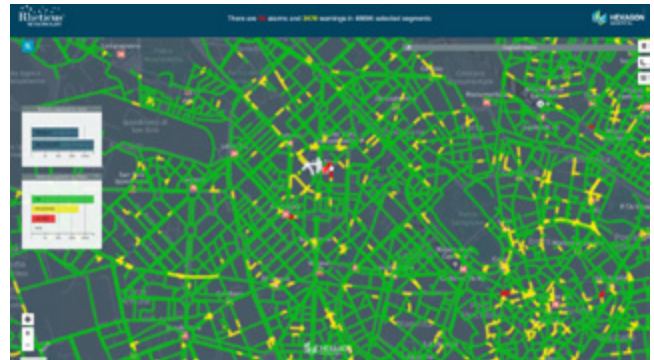
Automatically perform wide area monitoring each time a new dataset is released.

The Smart M.App is integrated with the monitoring services provided by Rheticus, and only requires information about the water or sewerage graph. Once these are loaded, the Smart M.App automatically attempts to locate any soil instability problems near sewage collectors or specific water network segments.